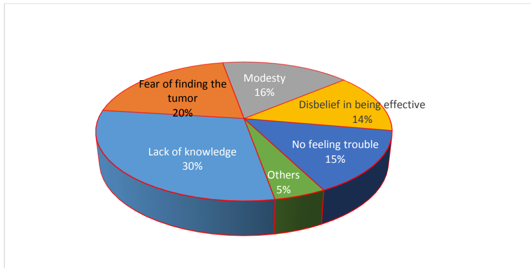
Figure2. Causes of not doing examination

The results of the correlation test between knowledge and attitude scores showed that this relationship was positive and significant. In other words, with increasing knowledge scores, women had a better attitude towards breast cancer ( r = 0.46 , p = 0.041 ). But regarding age and knowledge of individuals, there was found an inverse relationship that was statistically significant ( r = -0.68 , p = 0.013 ).