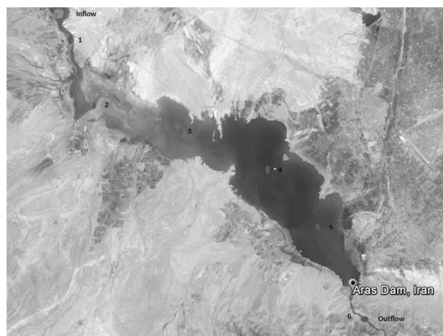
Figure 1. Map of the six sampling stations

Totally, 6 stations were sampled in a year 2013 (Figure 1). Stations chose with navigate location and as regards water depth, macrophytes population and wind direction of the dam place. Samples were taken in three water depth (surface- middle-upper depth) for each season. Therefore, a total of 144 samples were taken from different stations and various water depth. At each station, salinity and temperature were measured with a conductivity, temperature, and depth probe. Samples were collected using Niskin bottles. Dissolved inorganic nutrients (NO 3 , NO 2 , NH 4 ), dissolved inorganic phosphorus were measured using automated colorimetric techniques after filtration through GF/F filters. Dissolved oxygen and pH were detected using (Horiba-U10). Chlorophyll a (Chl-a) concentrations were analyzed on GF/F filters that were stored frozen until extraction and analysis by high-performance liquid chromatography.