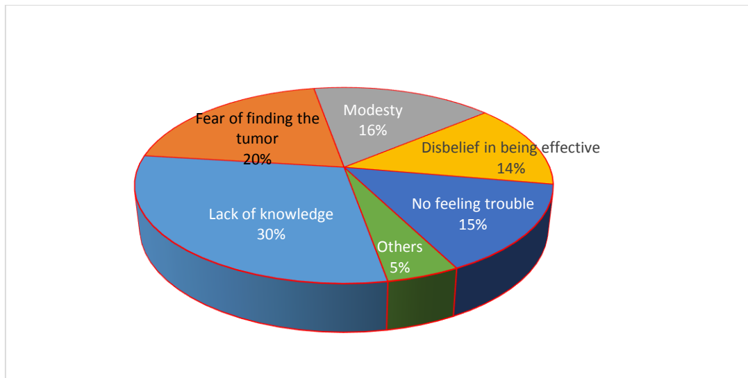
Figure2. Causes of not doing examination

The results of the correlation test between knowledge and attitude scores showed that this relationship was positive and significant. In other words, with increasing knowledge scores, women had a better attitude towards breast cancer ( r = 0.46, p = 0.041 ). But regarding age and knowledge of individuals, there was found an inverse relationship that was statistically significant ( r = -0.68, p = 0.013 ).